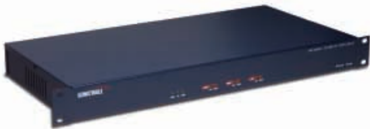
SonicWALL PRO 200